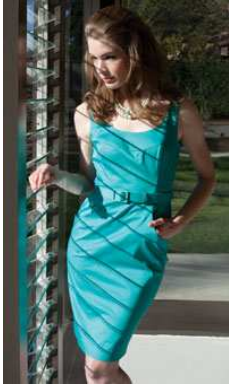
TOBIAS BELTED SHEATH DRESS WITH POCKETS $110 SIZES 2-14

Thumbnails from Plum's Spring 2010 Media Kit. Contact Katie O'Brien 604-808-1331 kate@plum.ca for high resolution images.