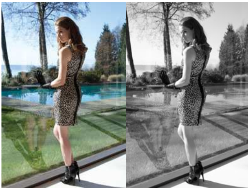
SIMONE SLEEVELESS DRESS W/EXPOSED TWO WAY ZIPPER $110 SIZES 2-14