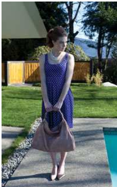
SIMONE DRESS WITH PLEATED WAIST AND POCKETS $115 SIZES 2-14